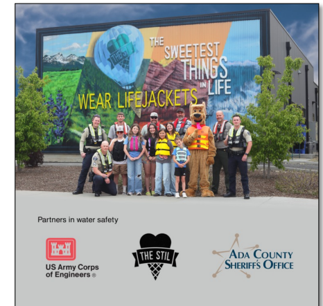
Above: Social media post to announce the incentive program coinciding with National Safe Boating Week,